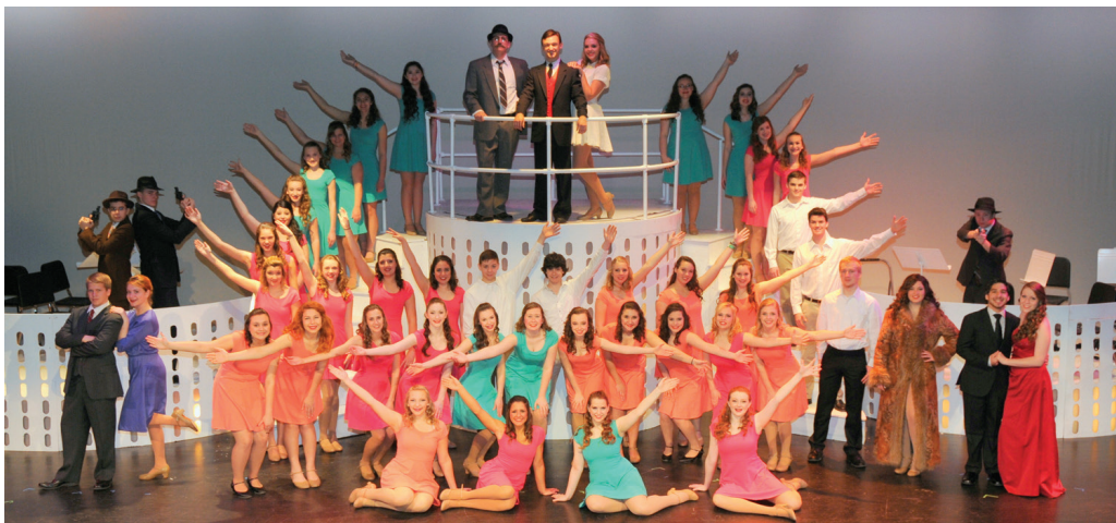
ABOVE: The cast of "Catch Me If You Can," which won The Gene Kelly Awards for best musical and best actor awards on May 24.